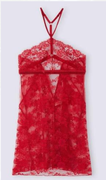
Women's Night Wear